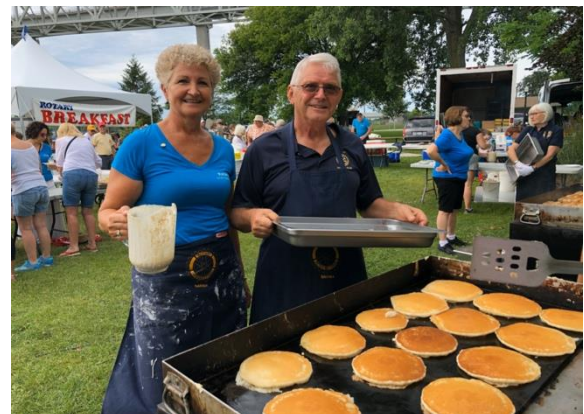
Rotary Pancake Breakfast Sarnia, Canada. Santa's Breakfast and book distribution in Pembroke Pines Florida USA