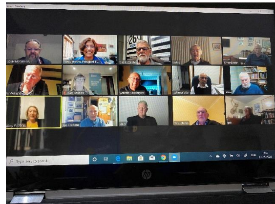
RC Goverdale/Waurn Pond Victoria Australia club members