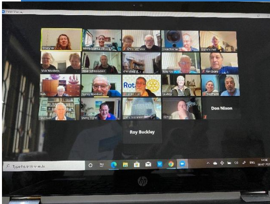
RC Wynnum & Manly Queensland Australia club members